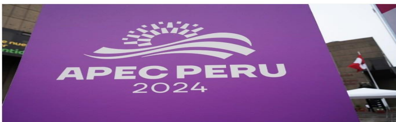
This photo shows the logo of the Asia-Pacific Economic Cooperation (APEC) 2024 meeting in Lima, Peru, Nov 8, 2024.

APEC has become an increasingly valuable platform for fostering international cooperation and promoting trade liberalization, experts said.