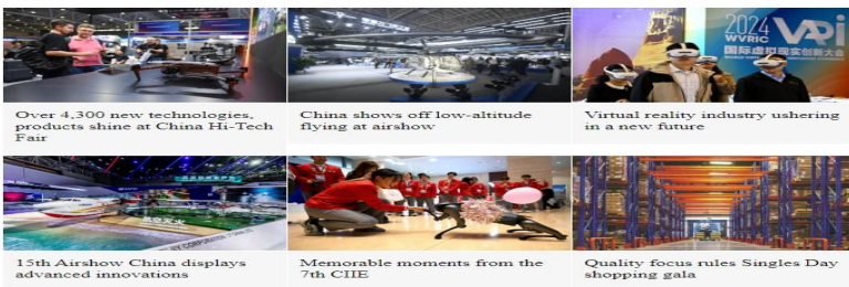
Over 4,300 new technologies, products shine at China Hi-Tech Fair